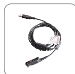
Programming cable PC155