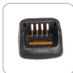
MUC Rapid-rate Charger