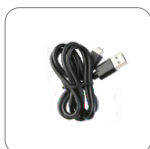
Data cable PC143