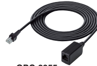
OPC-2355 2.5 m; 8.2 ft