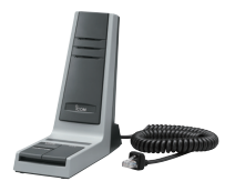
SM-28 Desktop microphone